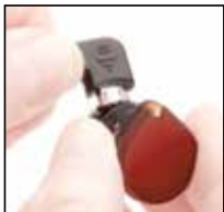
LED DayLite® UltraMini with convenient mini USB cable connection